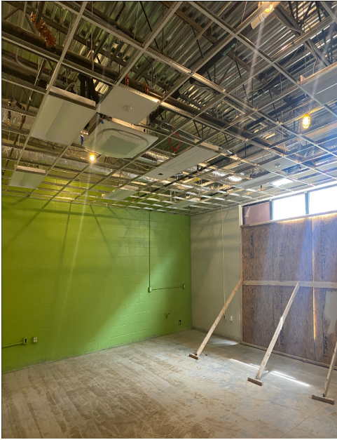
Ceiling grid install is 90% Complete throughout.