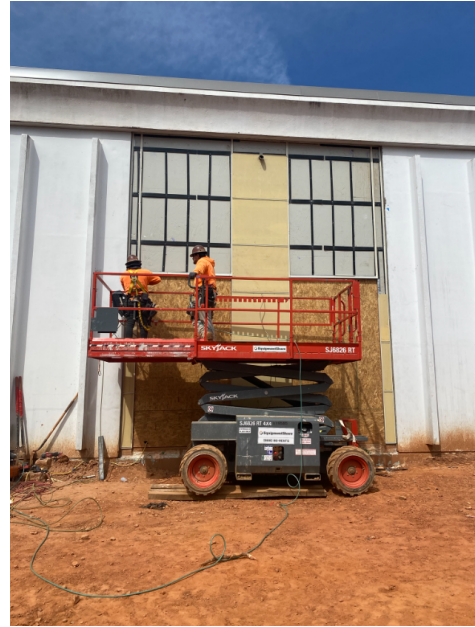
Continue to install FCP