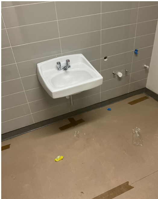
Begin installing plumbing fixtures